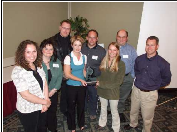
Interfaith Food Bank staff and directors were honored to receive a Better Business Bureau Business Ethics Award for 2008.

I am exceptionally proud to report that our efforts have been worthwhile, and in May of this year Interfaith Food Bank was honored to receive a 2008 Better Business Bureau Business Ethics Award! We are very much aware of the importance of not only being grateful for your support, but in being accountable with it. To be recognized by the community for ethical business practices